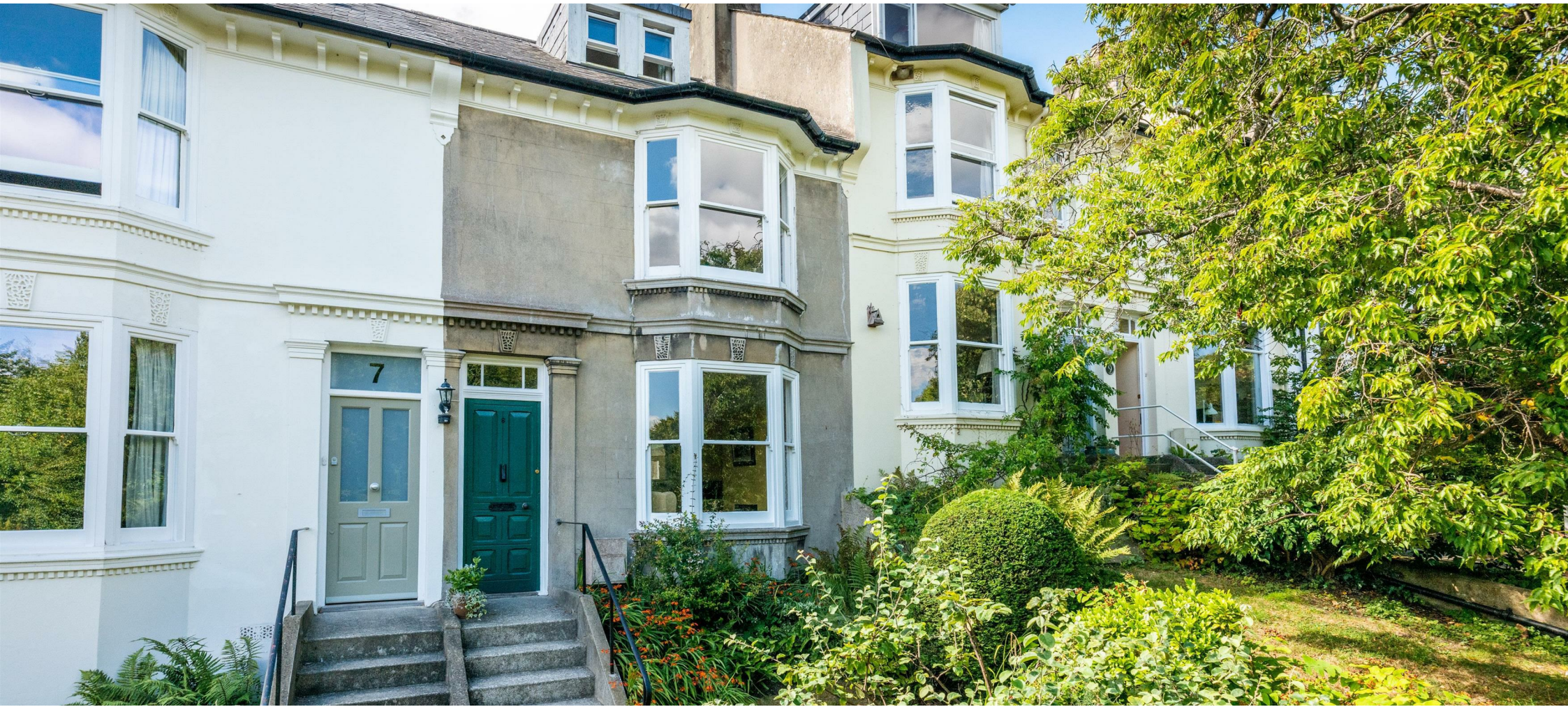
Pelham Terrace, Lewes